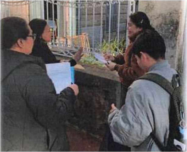
MWO Milan provides the OFWs food assistance thru grocery cards

All the OFWs were earlier given Financial Assistance in the amount of Two Hundred (200) USD through the AKSYON Fund of the DMW.